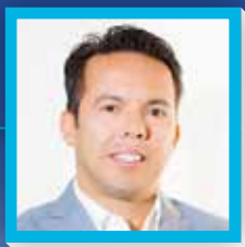
REV. SAMUEL RODRIGUEZ